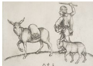
Martin Schongauer, The Miller , 1480 – 1485, engraving

His prints consist essentially of religious subjects drawn from the New Testament: the Childhood and Passion of Christ and the Life of the Virgin. The other religious compositions are figures of apostles, male or female saints, medallions containing the symbols of the Evangelists and a series illustrating the Parable of the Wise and Foolish Virgins.