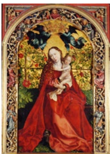
Martin Schongauer, Madonna of the Rose Bower , 1473, oil on wood panel, parish of St Martin, exhibited in the Dominican Church

at the Musée Unterlinden ; the Madonna of the Rose Bower can be seen in the nearby Dominican Church ; the Adoration of the Shepherds , two paintings of the Holy Family and the Virgin and Child are held in public collections outside France. Finally, we must also mention the frescoes in St Stephen's church in Breisach am Rhein. In each of these works, the Colmar master's pictorial language strikes a balance between the naturalism of the Flemish masters and the idealised softness inherited from the painters of the Upper Rhine.